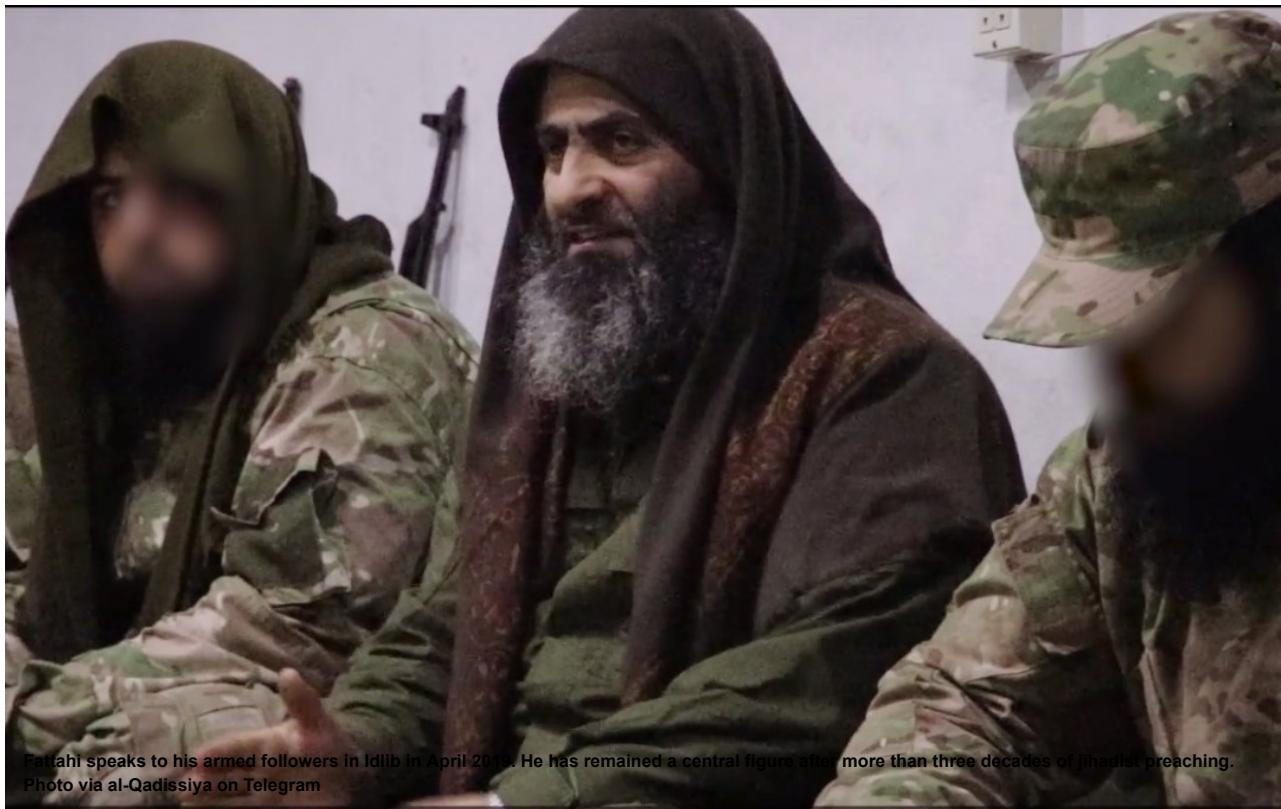
Fattahi speaks to his armed followers in Idlib in April 2019. He has remained a central figure after more than three decades of jihadist preaching.

Amid jihadism's ascent was Fattahi, who emerged at a mosque in Pishtap, a deprived neighbourhood in Mahabad, and found fertile ground to spew extremist ideologies and gain a huge following. The similarly deprived Mirawa neighbourhood of Bukan, West Azerbaijan province, where Fattahi had connections, was also a hotspot for radical preachers.