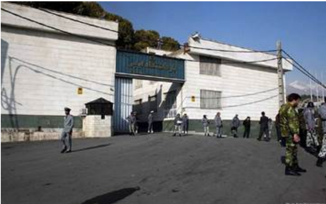
( https://www.rudaw.net/english/middleeast/iran/310720201 )

Iran in 'denial' of COVID-19 crisis in prisons : Amnesty ( https://www.rudaw.net/english/middleeast/iran/310720201 )