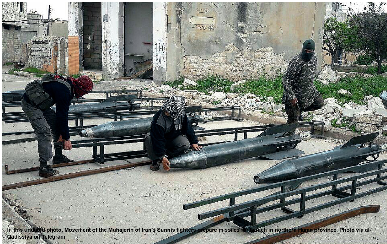
In this undated photo, Movement of the Muhajerin of Iran's Sunni fighters prepare missiles for launch in northern Hama province.