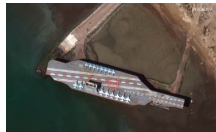
( https://www.rudaw.net/english/middleeast/iran/28072020 )

UK-Australian academic moved to harsh Iranian jail ( https://www.rudaw.net/english/middleeast/iran/29072020 )