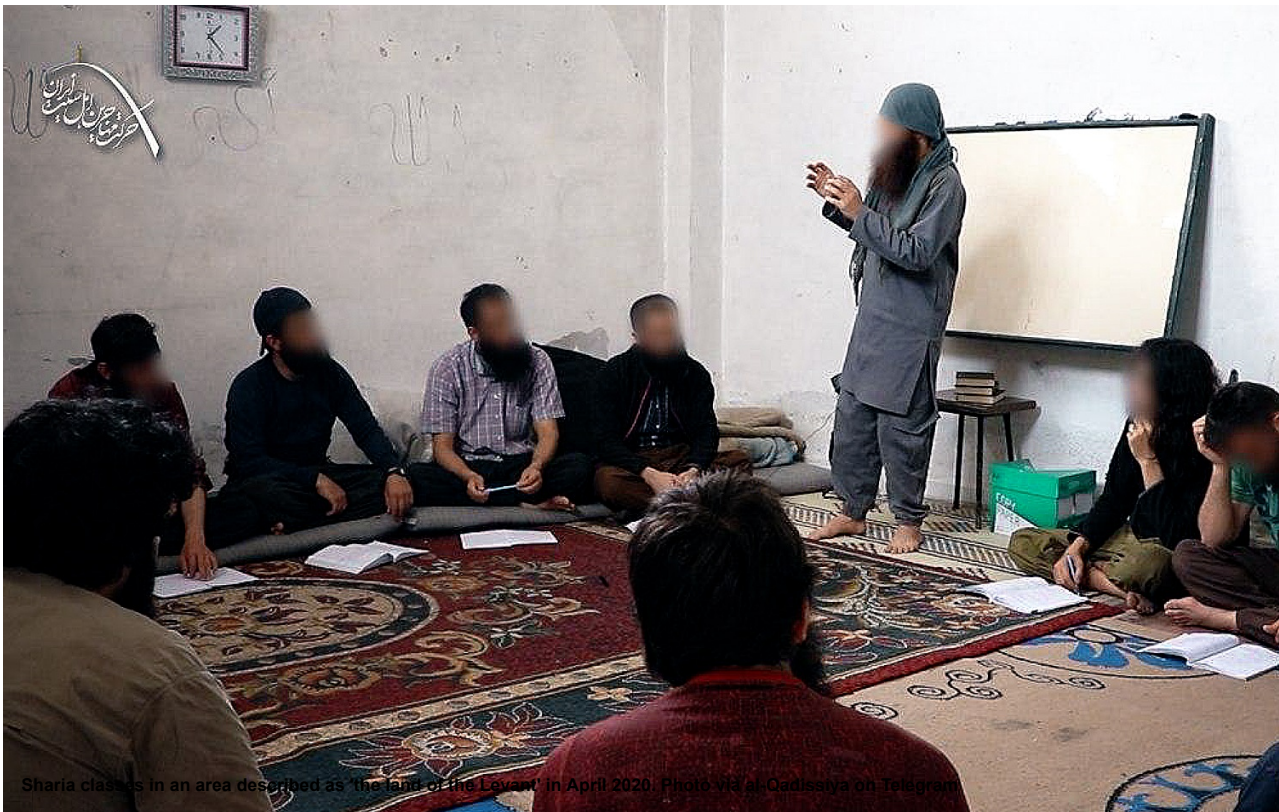
Sharia classes in an area described as 'the land of the Levant' in April 2020.

The fighting experience accrued in Idlib could prove the perfect primer for jihadists on their way home, Heller said, perhaps catalysing Kurdish jihadism the way Afghanistan or the Byara Emirate proved to do for Kurdish jihadists past. In an unsettling indicator of what could come to pass, at least 17 people died in a jihadist suicide attack ( https://www.al-monitor.com/pulse/originals/2017/06/iran-tehran-isis-attacks-kurdistan-salafist-recruitment.html?fbclid=IwAR3WAZ9cLos3w09hfSAvdDo3SydXmZvsXMV4skODDn711240i50sOXDIw3Q ) on Tehran in June 2017. Four of the five-member team that carried out the massacre were from Hawraman.