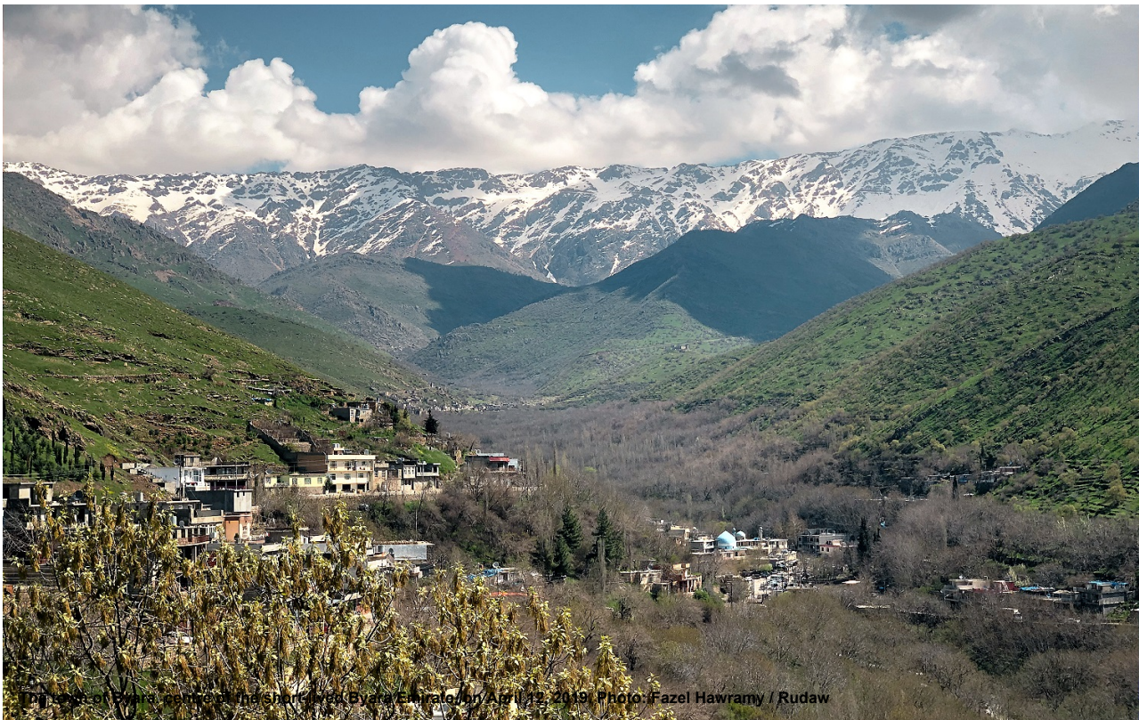
The town of Byara, centre of the short-lived Byara Emirate, on April 12, 2019.