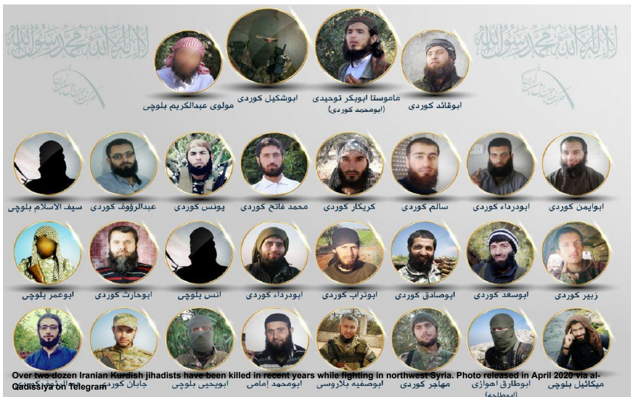
Over two dozen Iranian Kurdish jihadists have been killed in recent years while fighting in northwest Syria.