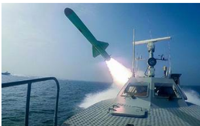
( https://www.rudaw.net/english/middleeast/iran/290720201 )

Iran in 'denial' of COVID-19 crisis in prisons : Amnesty ( https://www.rudaw.net/english/middleeast/iran/310720201 )