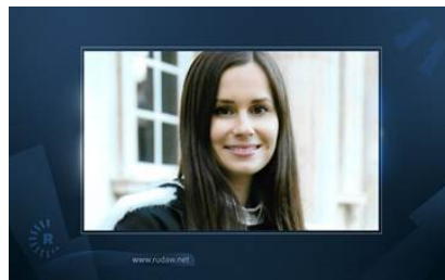
( https://www.rudaw.net/english/middleeast/iran/29072020 )

Iran launches underground ballistic missiles during exercise ( https://www.rudaw.net/english/middleeast/iran/290720201 )