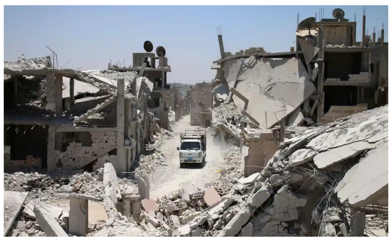
A truck drives down a destroyed street in a rebel-held area of Deraa in July 2017. The Syrian regime retook the province from rebels in July 2018.

Protests in south are being tolerated as Moscow juggles conflicting interests