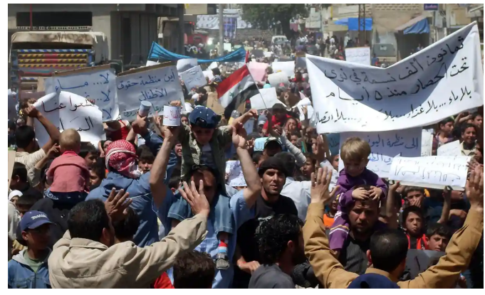
Anti-government protesters in Deraa in April 2011.

Alongside duties such as manning checkpoints and guarding against Isis sleeper cell attacks, the Fifth Corps is exchanging small-scale attacks with regime-loyal forces, shielding men wanted by Damascus for evading military service, and safeguarding the recent protests.